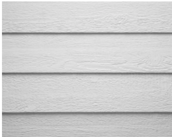
OLD MILL LAP (cedar wood grain)

Weyerhaeuser hardboard siding was available in a variety of textures. Some examples of common Weyerhaeuser hardboard siding textures are shown below.