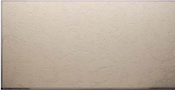
ADOBE PANEL (stucco texture)

Weyerhaeuser brand panel siding: Weyerhaeuser brand hardboard panel siding was available in 4' x 8' or 4' x 9' sheets. Each panel is either 7/16" or 1/2" thick. The panels generally have vertical grooves , most commonly spaced 8" on center. However the grooves also can be spaced 4" on center or 12" center. The groove can be a 3/8" striated groove, such as those found on T-111 plywood, a smooth cut 3/4" groove, a 3/8" smooth U-groove, or a 1-1/2" wide smooth "reverse batten" groove. Almost all Weyerhaeuser brand siding panels have a rough cedar wood texture with a few having cross-sawn wood texture or "Adobe" texture, which looks like a stucco wall and has no vertical grooves.