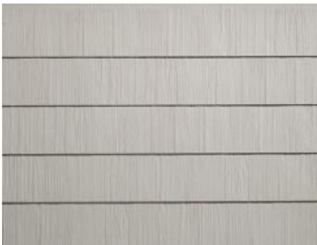
CEDAR SHAKE LAP