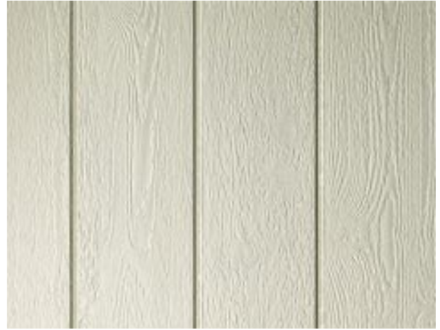
OLD MILL 808 PANEL (cedar texture-3/8" striated groove)